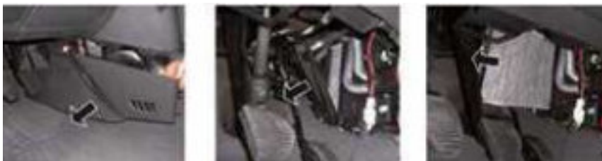
Pic.3 - Cabin filter located near the pedals