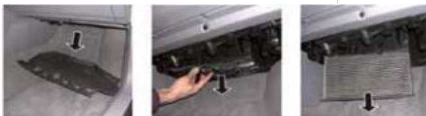
Pic.1 - Cabin filter located behind the glove box