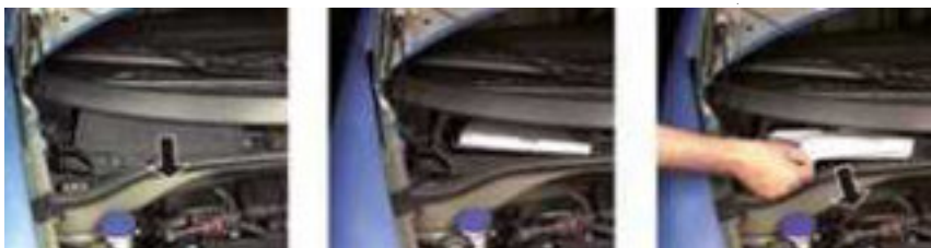
Pic.2 - Cabin filter located behind in the engine bay, under the windshield