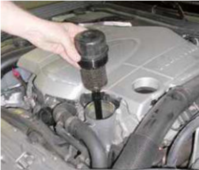
Pic. 4a - 4b